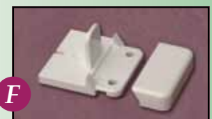
Kick Panel Wall Mount

Screening Material Not Supplied with Railing and Kick Panel Products