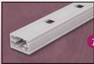
Railing Section Rail