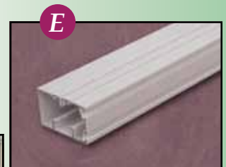
Kick Panel Rail