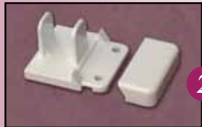
Railing Section Wall Mount