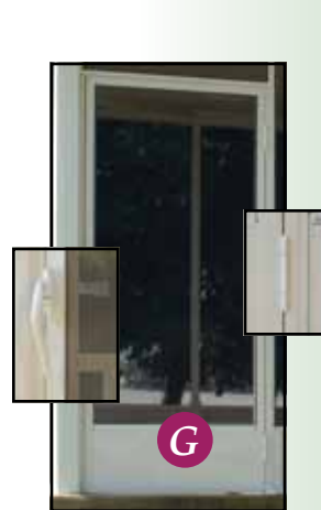
Assembled Universal Door