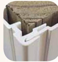
Fluted Column Clad Ratchets to Lock Together