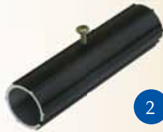
Internal Connector Aluminum