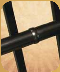
Collar Ring To Cover Splice