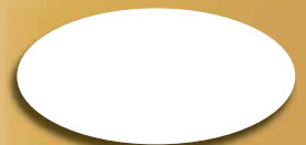
Gloss White DSI 102

Colors shown are a close representation of the true color. Please consult actual samples for accurate powder coating colors.