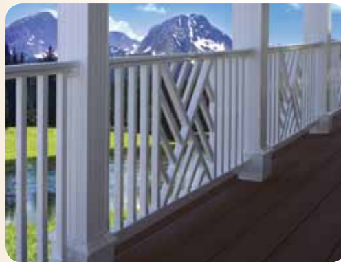
TRX Standard Spindles Double Chippendale White