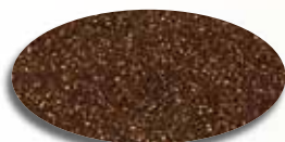
Speckled Walnut DSI 121