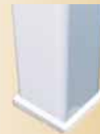
5" Flair (1-piece) Use w/Square Support Posts