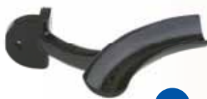
Inside Corner Mount Attaches to Post