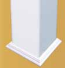
6" Decorative Flair (1-piece)