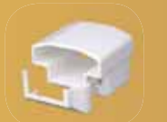
Top Stair/Angle Mount (uncut)