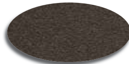
Bronze Fine Texture DSI 107