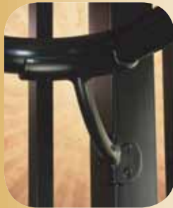
Inside Corner Mount Attaches to Post