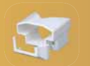
Top 45° Mount (factory pre-cut)