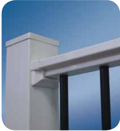
TRX "B" Series White Vinyl with Black Fine Texture Aluminum Spindles