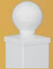
Ball Cap 4", 5"