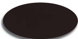
Chocolate DSI 124