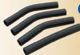
Handrail Elbows 5°, 31°, 34°, 36° Elbows