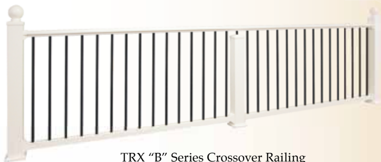
TRX "B" Series Crossover Railing White Vinyl with Satin Black Aluminum Spindles