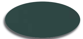
Evergreen DSI 111