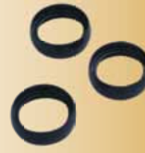
1/8" Collar Rings To Cover Splice