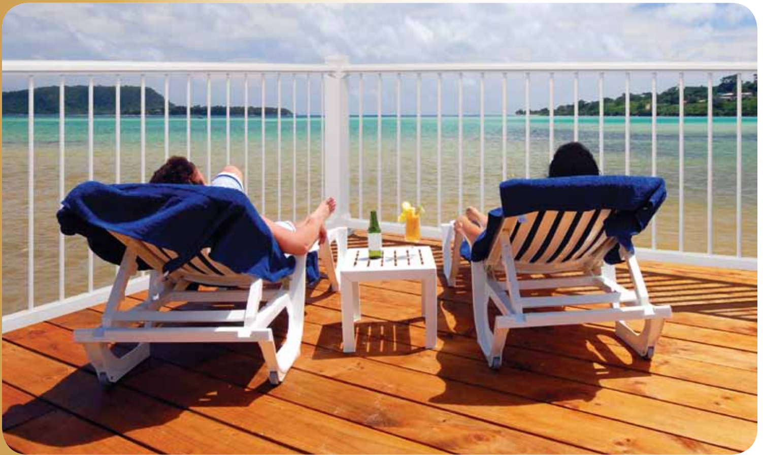
TRX "B" Series White Vinyl with Gloss White Aluminum Spindles