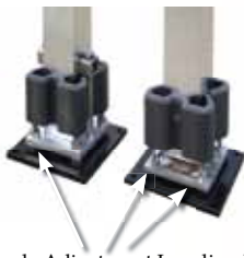
Angle Adjustment Leveling Bolts

Powder coated base plates resist corrosion and ACQ wood treatment.