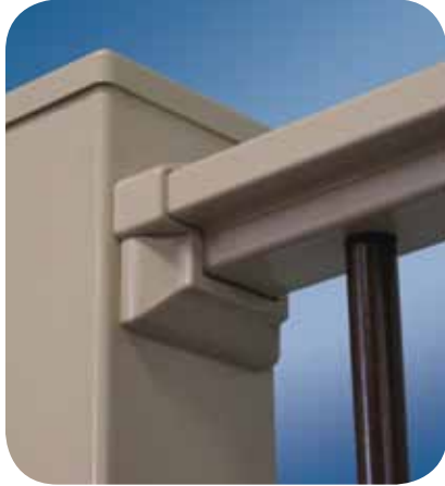
TRX "B" Series Tan Vinyl with Speckled Walnut Aluminum Spindles