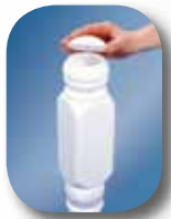
Decorative Post Caps are Easily Attached with Vinyl Adhesive