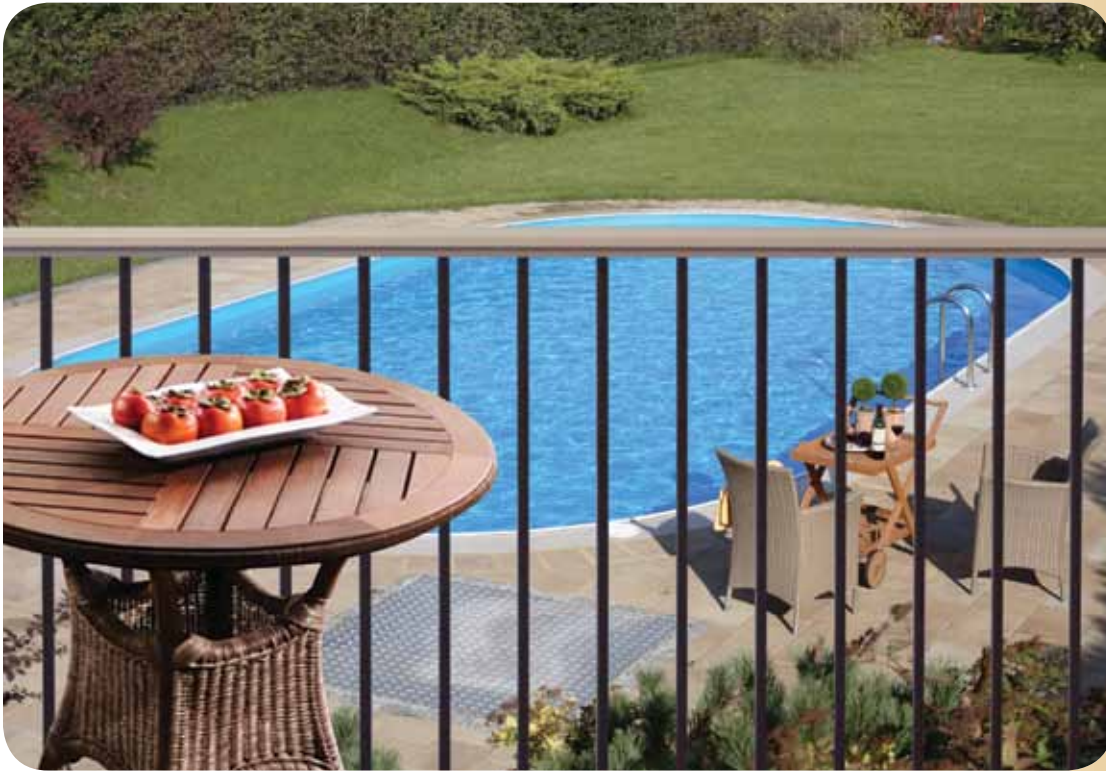
TRX "B" Series Tan Vinyl with Speckled Walnut Aluminum Spindles