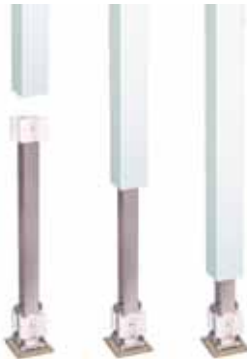
4" Post Sleeve

The Adjustable Aluminum Post Mounts used with Post Sleeves and "A" Series Newel Posts.