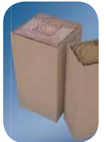
Smooth Column Clad Wraps Over the Wood Post - No Screws Needed