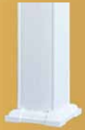
Smooth Column Clad Flair (4-piece)