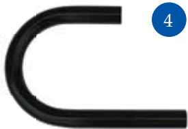
Handrail Return 180° Elbow