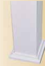
4" Snap Lock Flair (1-piece)