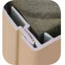
Smooth Column Clad Ratchets to Lock Together