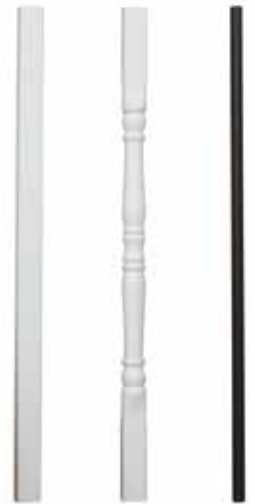
TRX Spindles Standard "A" Series "B" Series