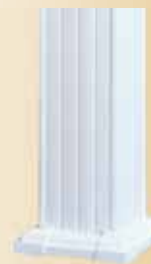
Fluted Column Clad Flair (4-piece)