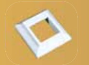
Bottom Rail Mount