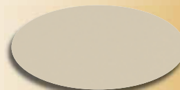
Gloss Beige DSI 104