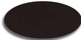
Chocolate DSI 124