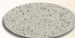
Sandy Shore DSI 122