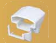
Top Stair Mount (factory pre-cut)