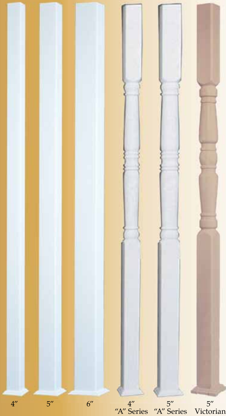
4" 5" 6" 4" "A" Series 5" "A" Series 5" Victorian