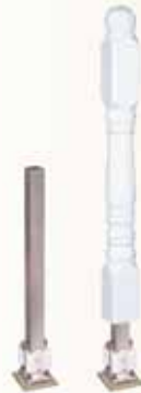
4" "A" Series Newel Post (Available in 38", 44", 48", 52")