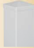
Flat Cap 4", 5", 6"