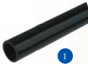
1 3/8" Handrail Aluminum