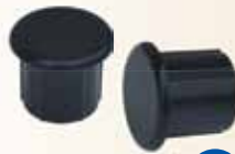
Internal End Cap