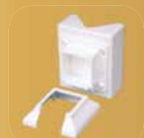
Bottom 45° Mount (factory pre-cut)