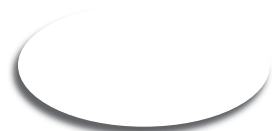
Gloss White DSI 102

Colors shown are a close representation of the true color. Please consult actual samples for accurate powder coating colors.