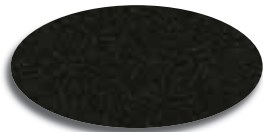
Black Fine Texture DSI 106