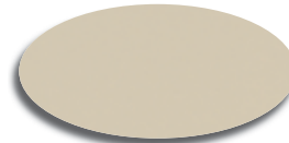
Gloss Beige DSI 104