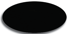
Satin Black DSI 101

Verified AAMA 2604-05 Compliant Powder Coating. Upgrade to optional AAMA 2605-05 powder coating available. Custom Colors Available. These standard aluminum spindle colors are available in all aluminum spindle styles.