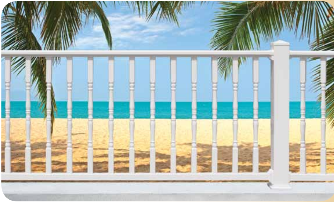
TRX "A" Series White