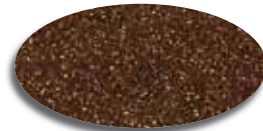
Speckled Walnut DSI 121