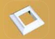
Bottom Stair/Angle Mount