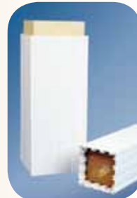
The Beautiful Vinyl Cladding Will Last for Years.