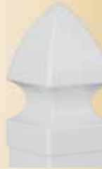
Gothic Cap 4", 5"