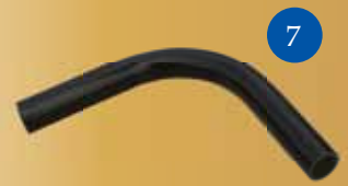
Handrail Elbow 90° Elbow