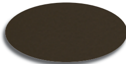
Metallic Bronze DSI 103