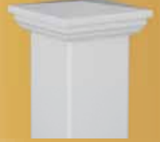
Trim Cap 4", 5"