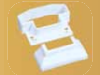
Top Rail Mount